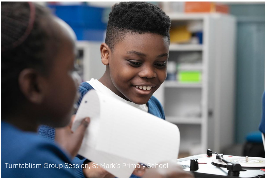
Turntablism Group Session, St Mark's Primary School

Sessions charged termly; schools decide how much of the cost to pass on to parents/guardians.