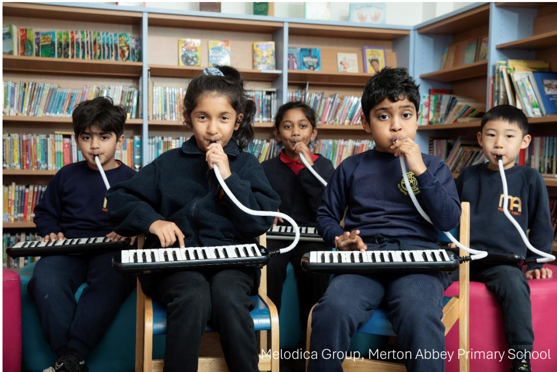
Melodica Group, Merton Abbey Primary School

Pupils develop the core musical skills, knowledge and understanding using a range of classroom instruments and singing. Perfect for KS1 and lower KS2 pre-WCET.