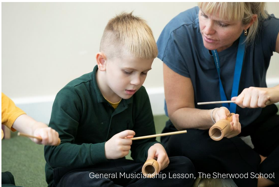
General Musicianship Lesson, The Sherwood School

We deliver a regular programme of half-day and twilight CPD sessions from our South Wimbledon Music Centre – details shared to Music Coordinators via our regular digest emails.