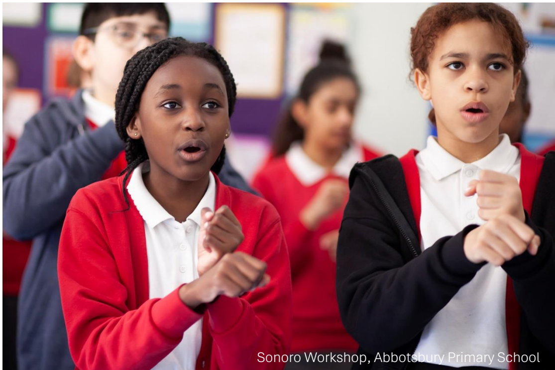
Sonoro Workshop, Abbotsbury Primary School

Small group, 30-minute weekly sessions delivered by a music specialist trained by MMF in partnership with the Changing Tracks National Nurture Group programme. Music making is used as an entry point for developing pupils' emotional resilience. For school-selected targeted groups of pupils at risk of poor educational outcomes.