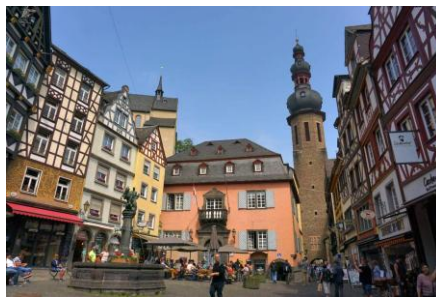
Cochem Town centre: