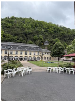
Here's where we will be performing: